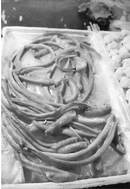
Fig. 1. Skinned hagfish are sold as food in a local fish market.

trade in leather goods produced from tanned hagfish skin. Although the products are branded as eel skin (wallets, etc.), actually they are made from hagfish skin. In Taiwan, they are referred to as “dragon tendon” and are mainly consumed as sea food. As shown in Figure 1, skinned hagfish are sold as food in local fish markets.