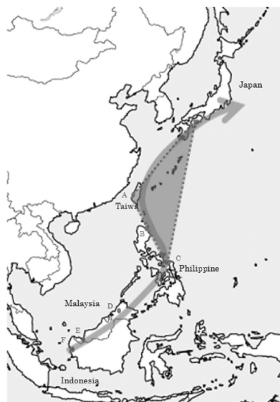
Fig.3. Kuroshio Triangle and S-Shaped Zone.

and Environment”. More recently, given the urgent need to establish a sustainable society in the region, young minds of scientists, researchers, planners, managers, and educators from borderless regions have worked together on information exchange, and on achieving strong cooperation and collaboration among institutions to create a holistic body of knowledge and information for the benefit of both people and the environment. Similarly, scientific findings and results are