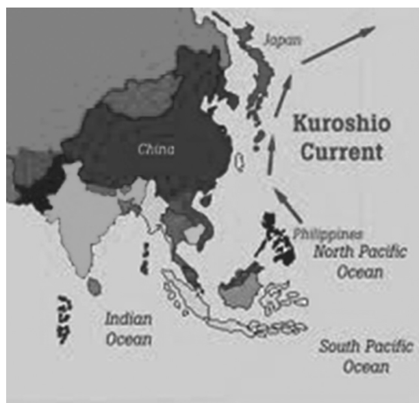
Fig.2. Kuroshio Current.

Last year’s symposia co-hosted by Tanjungpura University and Universiti Malaysia Sarawak put emphasis on enhancing management through “Harmony between People