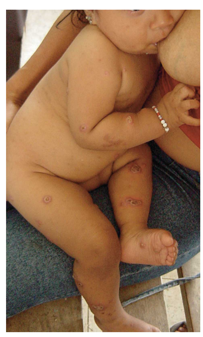
FIGURE 3. Ulcerative lesions disseminated during 3 months on the head, trunk, legs, and arms in our 1-year-old patient of disseminated cutaneous lesions in the sole.

Patient 1. A 4-year-old boy presented with a large painless erythematous lesion on the face (Figure 1). It had evolved from an initial papule in the left cheeck first noticed 5 months earlier and which gradually spread. The lesion was treated