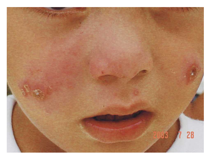
FIGURE 1. Clinical image of patient 1, erythematous and indurated plaque in both cheeks joined by a large infiltrate thorough upper lip and nose. A punch biopsy had been performed 2 weeks ago at the center of the plaques.